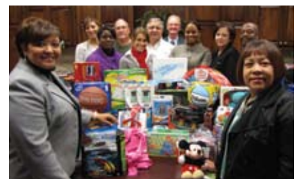
Christmas Toy Drive