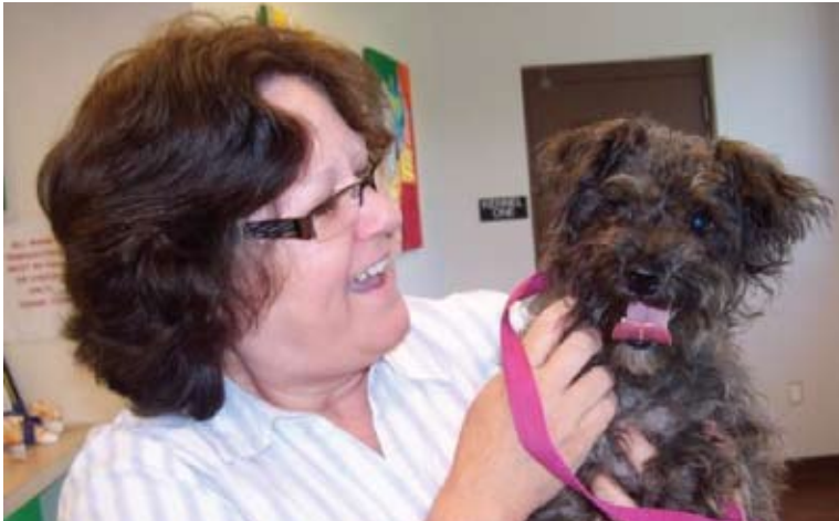
Looking for a pet? Consider adopting one from our shelter.

Three animal control officers round up stray dogs and cats and bring them to the parish animal shelter. Their efforts are supported by volunteers and The Rotary Club of LaPlace. Be a responsible pet owner and spay or neuter your pets.