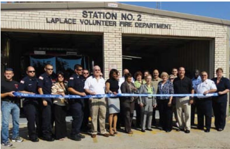
The Walnut Street Fire Station has been renovated.