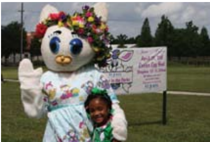
Easter in the Park