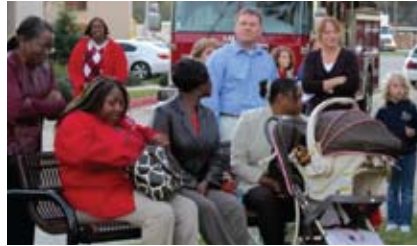
Adoption Awareness Celebration