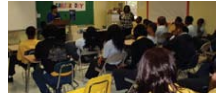
Leon Godchaux Accelerated Program