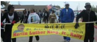
Martin Luther King, Jr. Day