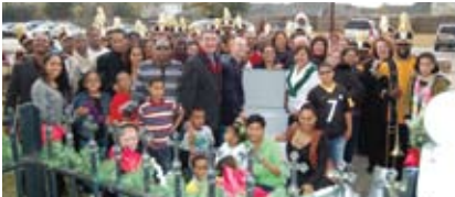
Reserve 150 Sesquicentennial Time Capsule Burial