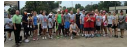
Special Olympics Torch Run