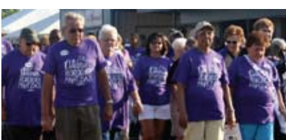
Relay for Life