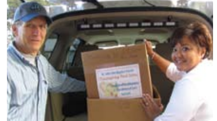
Thanksgiving Food Drive