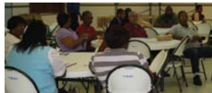
West Bank Brown Bag Lunch