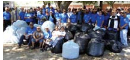
Clean Sweep St. John