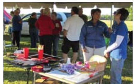
Night Out Against Crime