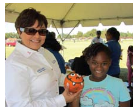
Garyville Park Picnic