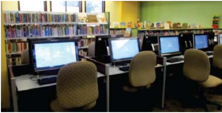
The newly renovated Reserve library is open for business.

The Reserve library has undergone renovations, enhancing its ability to serve the community. A major expansion is underway at the LaPlace library and collections are increasing at the Garyville and Edgard branches.