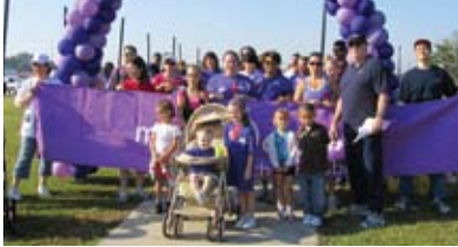
March of Dimes Fundraiser

Members of parish government work to better our community by being a part of our community. Throughout the year, we participate in many events that help make St. John an even greater place to live.